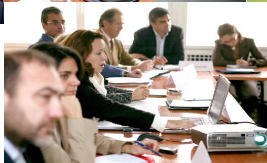
Information meeting on Biomass, 1 st February 2007

Title: Information Meeting on the “Forum: Biomass Market for Electricity Generation Plants in Andalusia”