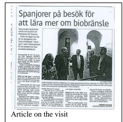
Article on the visit