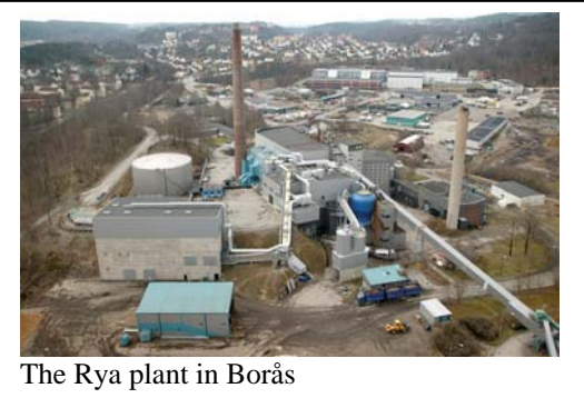
The Rya plant in Borås