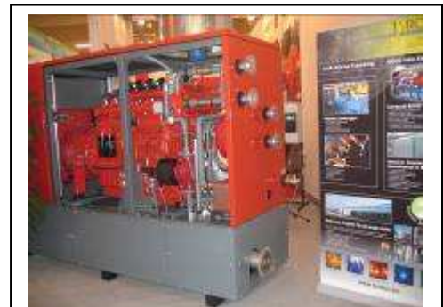
A CHP unit interesting for the West Swedish development of bioogas

The World Sustainable Energy Days, arranged by ESV and the Energiesparmesse, is considered to be one of the main events for actors involved in the small-scale renewable energy sector. For several years discussions has been held with West Swedish market actors and other relevant organisations to arrange a delegation to improve the market and technology knowledge and to get valuable input to future developments in the region as well as for market actors in Sweden.