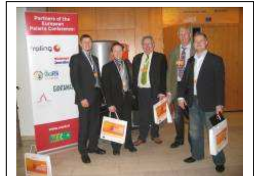
The group from West Sweden

After an invitation from ESV a group of five persons from West Swedish organisations visited upper Austria to learn more about the small scale RES-e market.